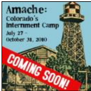
EXHIBIT: AMACHE: COLORADO'S JAPANESE INTERNMENT CAMP July 27 – October 31, 2010

Imagine being given one week's notice that you have to leave your home, taking only what you can carry. Nearly 120,000 Japanese Americans were ordered to do just that in 1942. Some came to an internment camp called Amache in Southeastern Colorado.